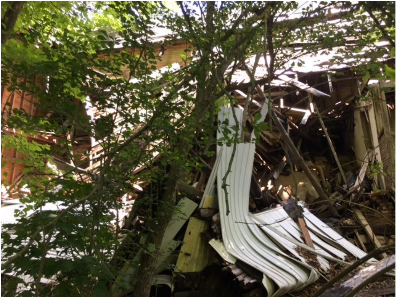
Existing condition, shed-roof addition on west elevation, July 2022.