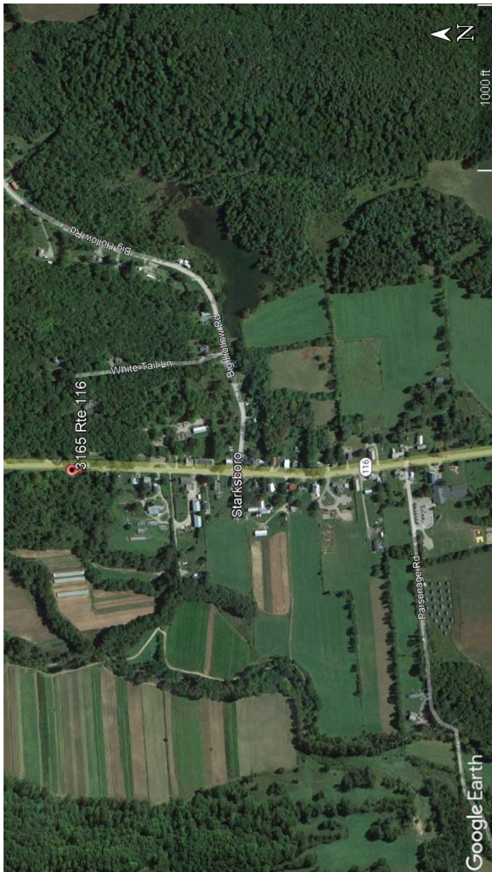
Location map for former Lou Gordon Store, 3165 VT Route 116, Starksboro.

* Formerly known as the Historic Sites and Structures Survey