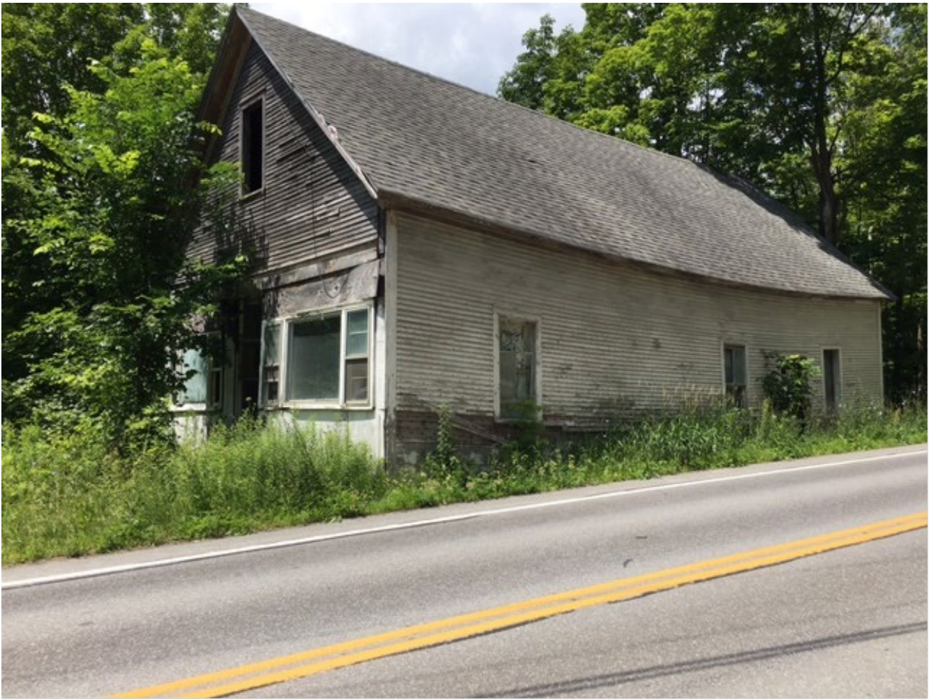
Existing condition, façade (south) and side (east) elevations, July 2022.