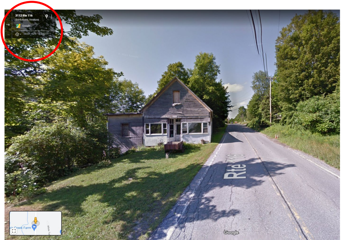
Google Earth image from 2011. The red circle encircles the date of the image.

* Formerly known as the Historic Sites and Structures Survey