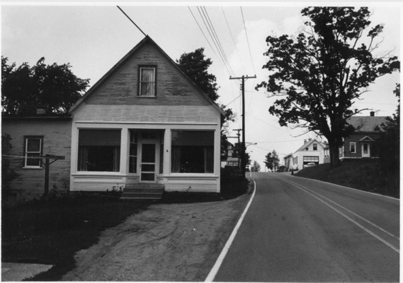
Copy of photograph from the 1975 Historic Sites and Structures Survey.